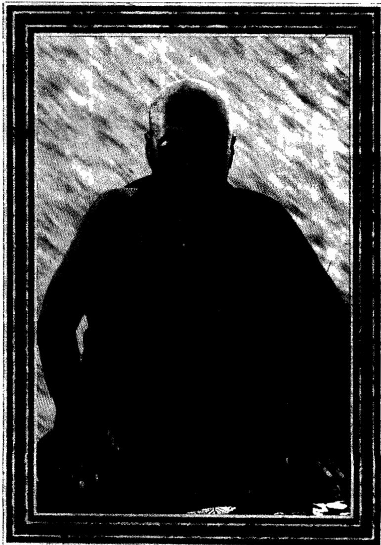
Venerable Mogok Saya Daw Baddanta Vimala