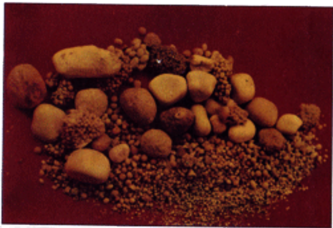
Dattaws formed from Sayadaw's Bones, Sinews, Blood and Flesh.