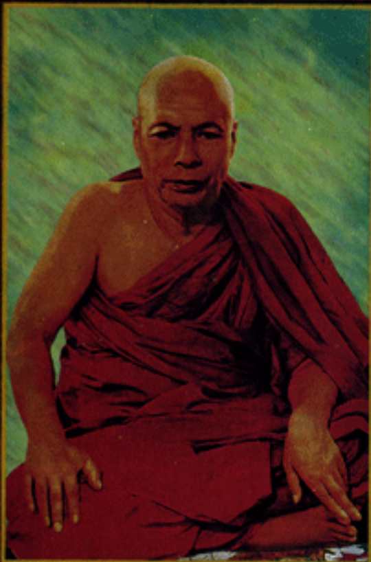
Venerable Mogok Saya Daw Baddanta Vimala