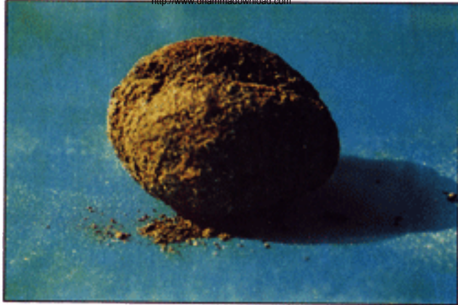
One of Sayadaw's Eyes that still remains in Mogok. Both Eyes were untouched by fire during the Cremation Ceremony.